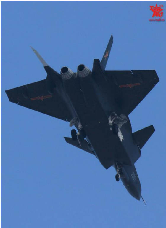
Exhibit 1: J-20 in flight

China’s J-20 test thus resembles a muted strategic communication to an international audience, not a formal one that might provoke diplomatic discord in advance of President Hu Jintao’s 19 January state visit to the U.S. Jane’s quoted Chinese sources as suggesting that “China may have accelerated the schedule for the J-20’s maiden flight after the US Department of Defense (DoD) finally agreed to modernise Taiwan’s fleet of Lockheed Martin F-16A/B fighter aircraft.” Regardless of the precise intention this time, such releases of military information are increasing of late as China for the first time has world-class capabilities to show off, and engages in “selective transparency” to get credit for those capabilities—both from its domestic populace, and from potential competitor nations.