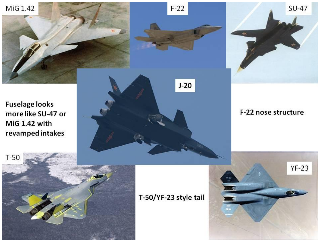
Exhibit 4: J-20 resembles aspects of other late-gen fighters