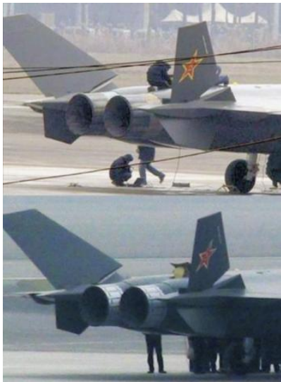
Exhibit 5: J-20 prototype engine nozzles are different (top image AL-31, bottom WS-10A)

Engines are critical for any aircraft. This is one type of system that either works well or does not, with little potential for significant incremental adjustment. Some Russian sources quoted in a recent Sina.com article claim that the J-20 is using AL-41 engines, but most Chinese, Russian, and English-language sources and photo imagery suggest the J-20 prototypes are likely using a version of the WS-10 (already used in the J-11B, according to China Air and Naval Power ) and the Russian AL-31 engines ( Exhibit 5 ). According to Shanghai Daily/People's Daily Online , "two [J-20] prototypes have been developed, with one employing a Russian engine and the other a Chinese one. It wasn't clear which prototype flew" on 11 January.