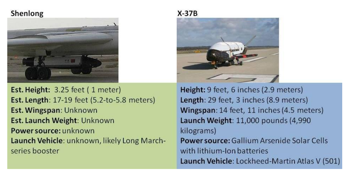
Exhibit 2: Shenlong as compared to X-37B