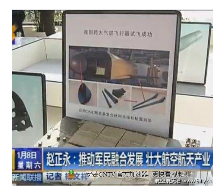
Exhibit 3: Alleged images of new Chinese spaceplane prototype Caption at top of slide reads "China's trans-atmospheric vehicle tested successfully"