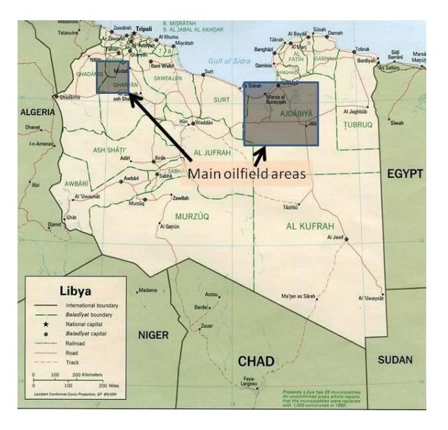
Exhibit 2: Libya road and oilfield map

neo-colonial or otherwise suspect. Unfavorable opinions would likely be magnified by communication difficulties between Chinese and Libyans.