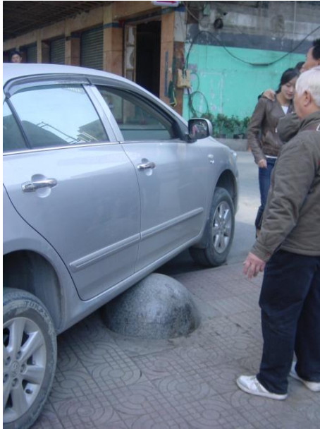
Guizhou driver gets car stuck